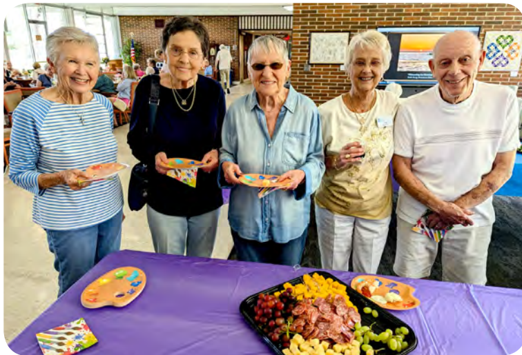
Westminster Woods residents enjoyed refreshments and great camaraderie at their campus Art Show reception.