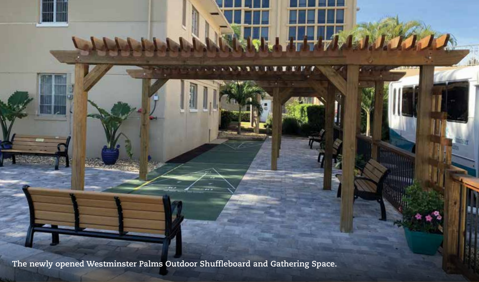
The newly opened Westminster Palms Outdoor Shuffleboard and Gathering Space.